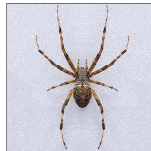
Neoscona theisi Walckenaer, 1841