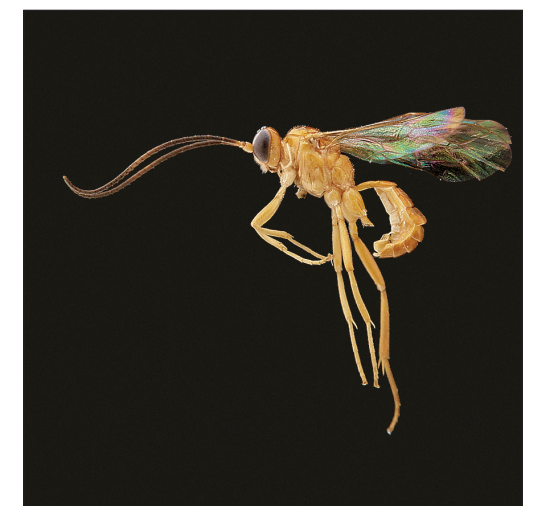
Fractipons glabriusculus Bordera & González-Moreno, sp. n.