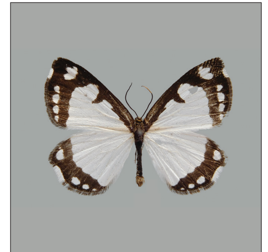
Psychostrophia micronymphidiaria Huang & Wang, sp. nov.