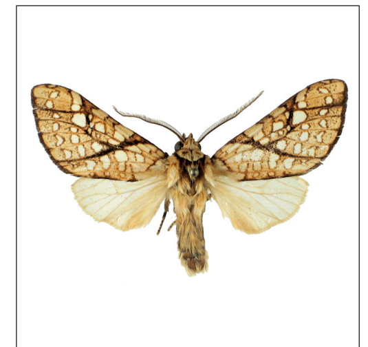
Lophocampa lineata Vincent, sp. n.

ZooKeys Launched to accelerate biodiversity research