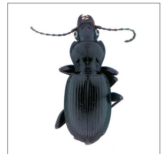
Pterostichus (Pseudoferonina) lolo Bergdahl, sp. n.