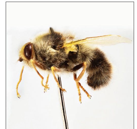
Gasterophilus nigricornis (Loew, 1863)