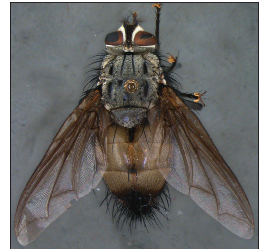
Zelia magna Dios & de Santis, sp. nov.