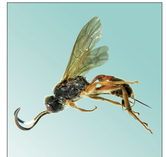
Carinityla punctulata Sheng & Sun, sp. n.