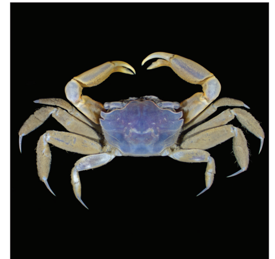
Metaplax elegans De Man, 1888