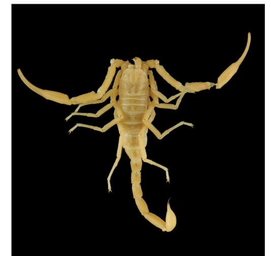
Vietbocap canhi Lourenço & Pham, sp. n.

ZooKeys Launched to accelerate biodiversity research