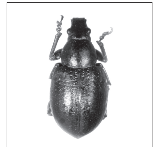
Obrieniolus robustus del Río, sp. n. Río, sp. n.