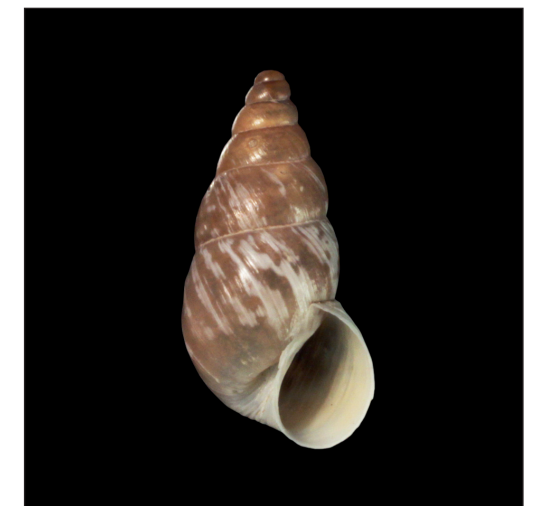
Turanena demirsoyi Gümüş, Eike Neubert, sp. n.