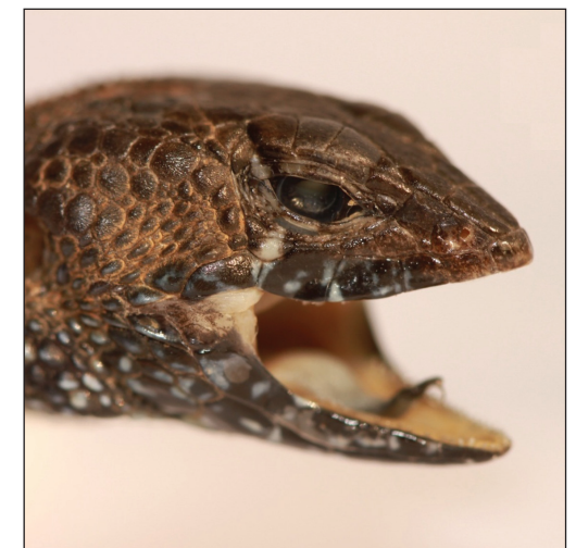
Potamites montanicola Chávez & Vásquez, sp. n.