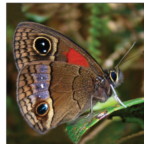
Calisto occulta Núñez, sp. n.