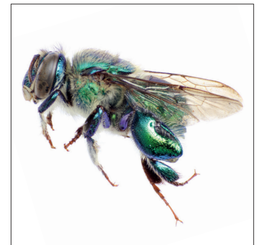
Euglossa obrima Hinojosa-Díaz, Melo, & Engel, sp. n.