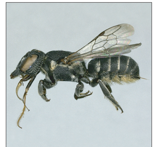
Noteriades spinosus Griswold & Gonzalez, sp. n.

ZooKeys A peer-reviewed open-access journal Launched to accelerate biodiversity research