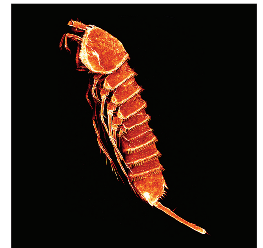
Mesocletodes elmari Menzel, sp. n.