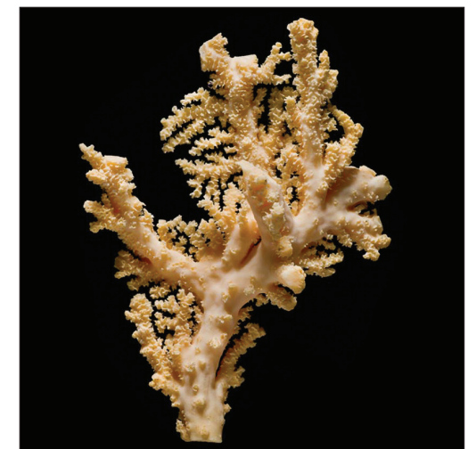
Errinopora fisheri Lindner & Cairns, sp. n.