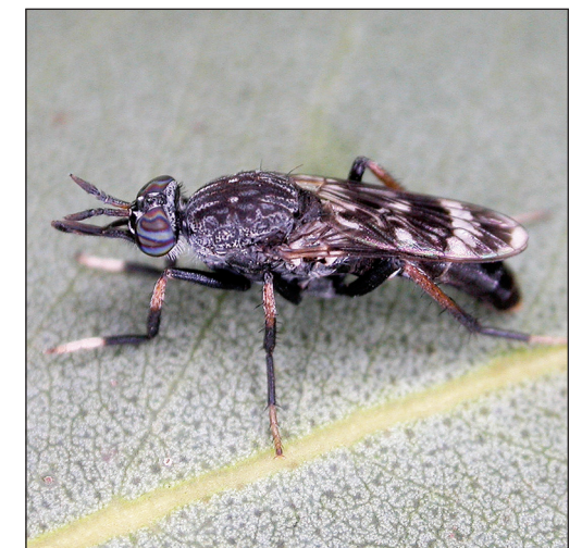
Acupalpa yanchep Winterton, sp. n.