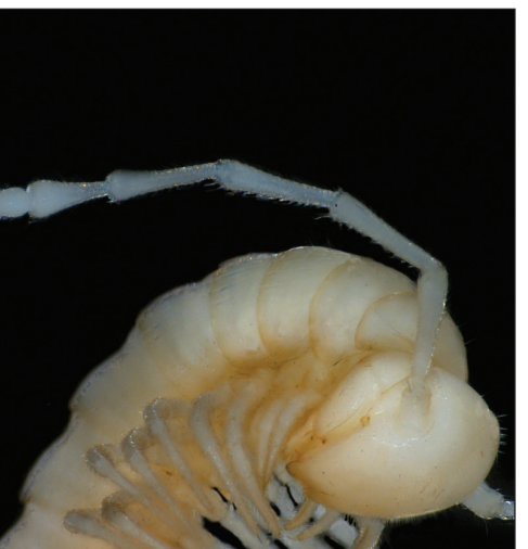
Sinocallipus jaegeri Stoev & Enghoff sp. n.

ZooKeys Launched to accelerate biodiversity research