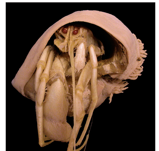
Stylobates birtlesi Crowther, Fautin & Wallace sp. n.

ZooKeys Launched to accelerate biodiversity research