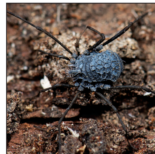
Ortholasma colossus sp. n.