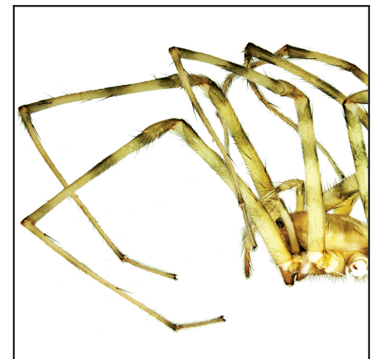
Tegenaria baynami sp. n.