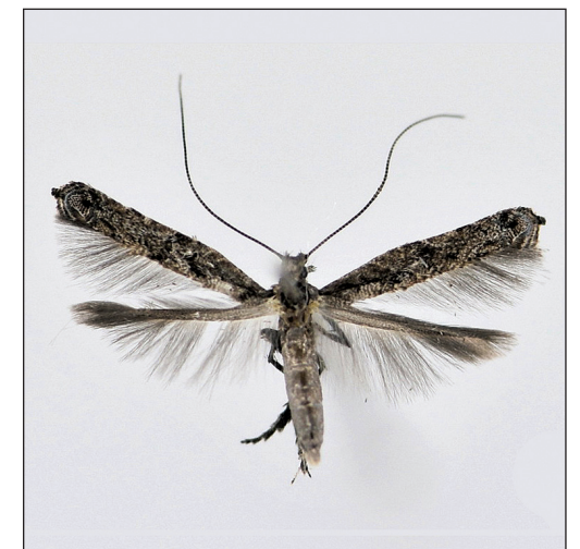
Conopomorpha flueggella Li, sp. n.