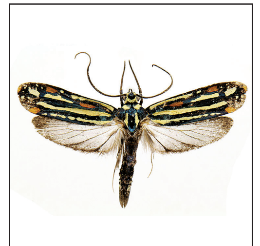
Atteva hyginiella (Wallengren, 1861)

ZooKeys Launched to accelerate biodiversity research