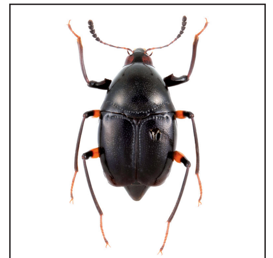
Scaphidium spinatum Tang & Li, sp. n.