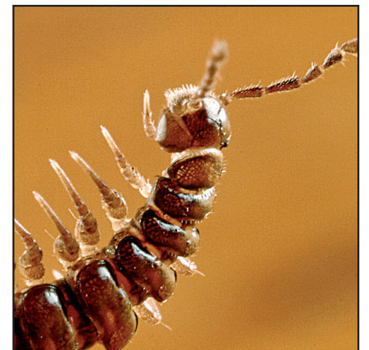
Tasmaniosoma armatum Verhoeff, 1936