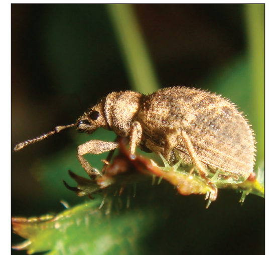
Sciaphilus asperatus Bonsdorff, 1785