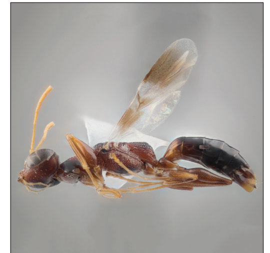
Dryinus georgianus Speranza et al., sp. nov.