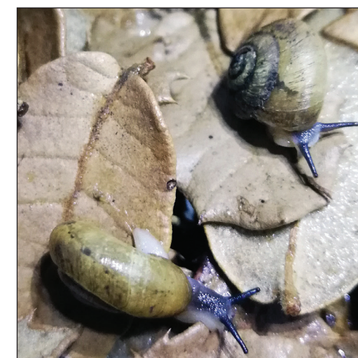
Sinoxchilus melanoleucus Wu & Liu, gen. nov. and sp. nov.