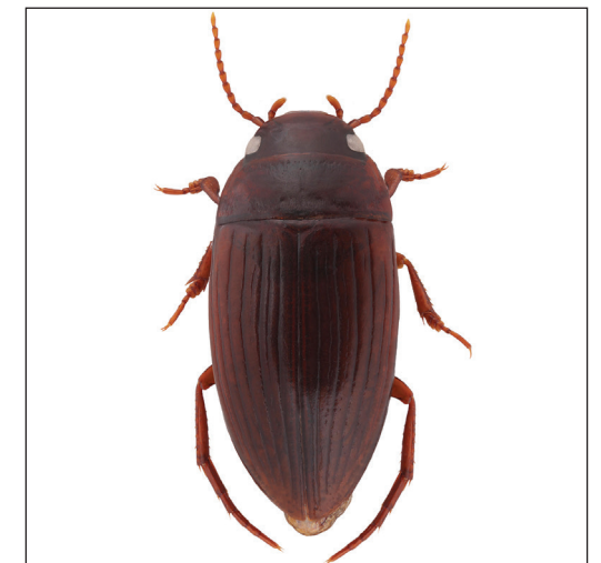
Copelatus pseudostriatum Ranarilalaitiana & Bergsten, sp. nov.