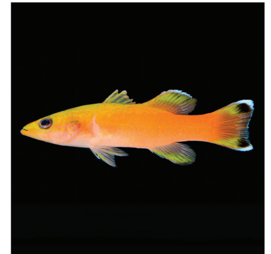
Liopropoma incandescens Pinheiro et al., sp. nov.