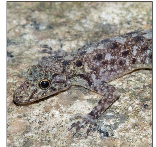
Cnemaspis adangrawi Ampai et al., sp. nov.