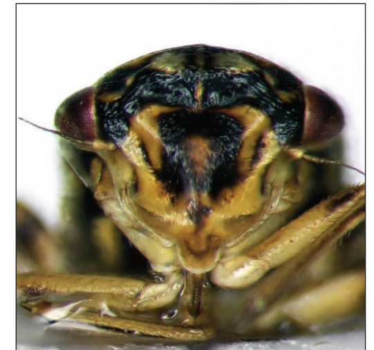
Oncopsis moxiensis Li, Li & Dai, sp. nov.