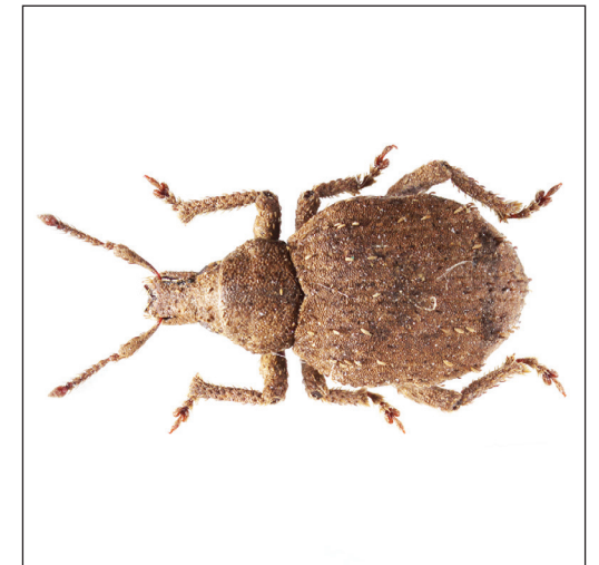
Pseudocneorhinus obliquehumeralis Ren et al., sp. nov.