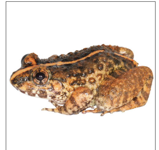
Limnonectes sava Phimmachak et al., sp. nov.