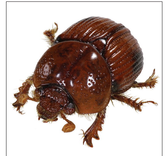
Bolbochromus (Bolbochromus) luzonensis Li & Krikken, sp. n.