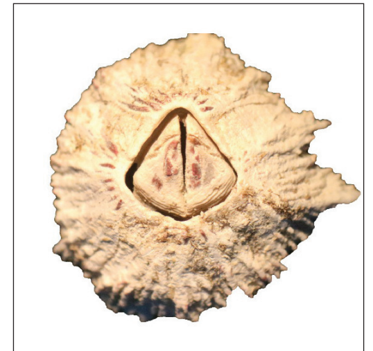
Neonrosella vitiata Darwin, 1854