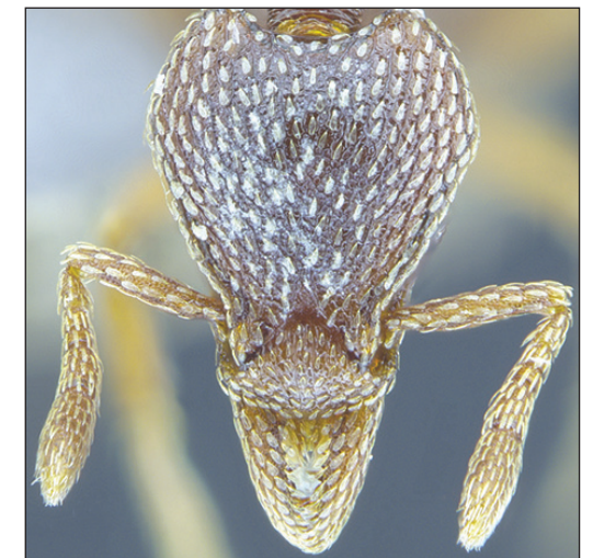
Strumigenys nathistorisoc Tang et al., sp. n.