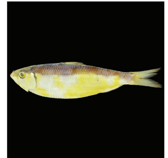
Sardinella pacifica Hata & Motomura, sp. n.