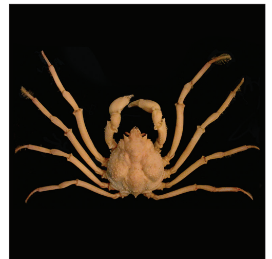
Collodes anartius Colavite et al., sp. n.