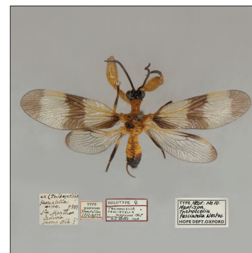
Mantisa (Trichoscelia) fasciatella Westwood, 1867