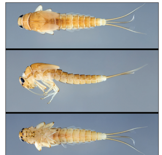
Tenuibaetis fujitani Kaltenbach & Gattolliat, sp. n.