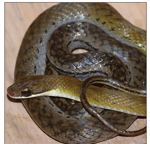
Erythrolamprus pseudoreginae Murphy et al., sp. n.