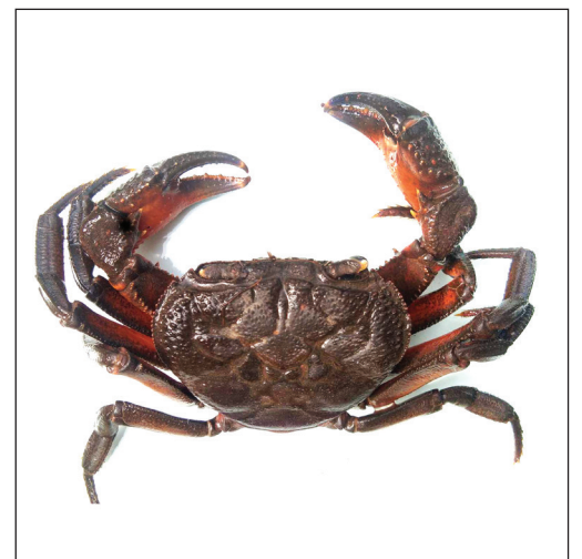
Indochinamon khinpyae Ng & Mar, sp. n.