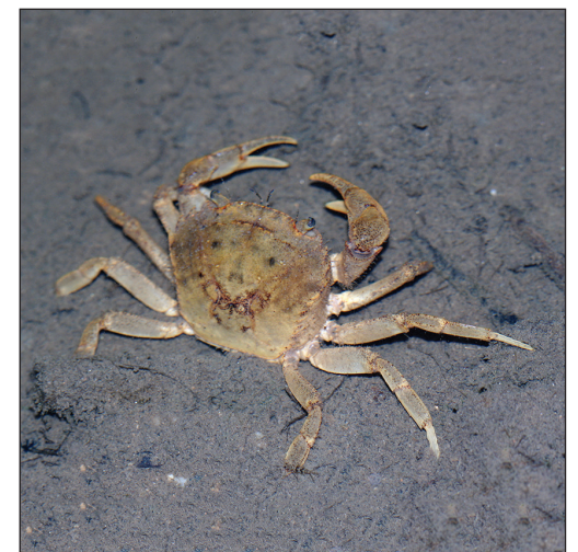
Nanhaipotamon macau Huang et al., sp. n.