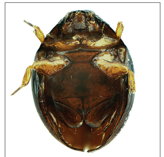
Sphaerius minutus Liang & Jia, sp. n.