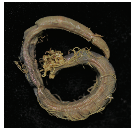
Timarete posteria Choi et al., sp. n.