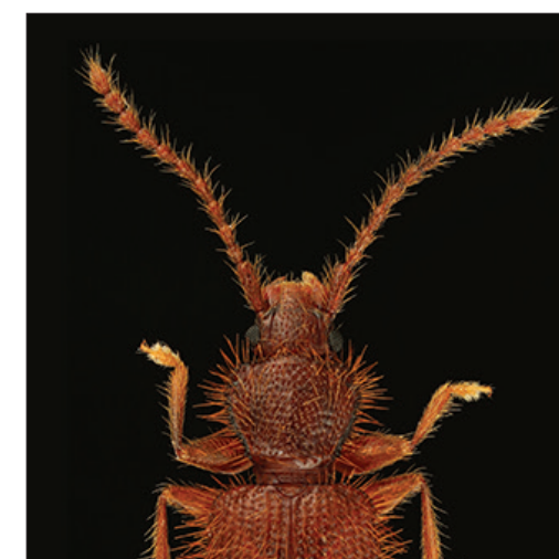
Borneophanus spinosus Yoshida & Hirowatari, sp. n.