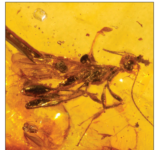
Electrostephanus petiolatus Brues